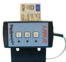
Mounting bracket optional

Kit Contents: 'Digidown Plus' Download Device 2 x AA-size alkaline battery USB upload cable Mounting bracket (opt.) User instructions