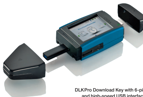
DLKPro Download Key with 6-pin and high-speed USB interface